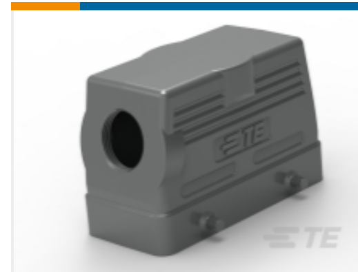
TE Part # T1210160132-000 H16B-TS-M32