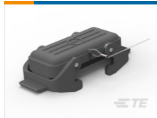
TE Part # T1010241200-000 H24B-KDTP