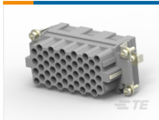
TE Part # T2050482201-007 HEEE-048-F